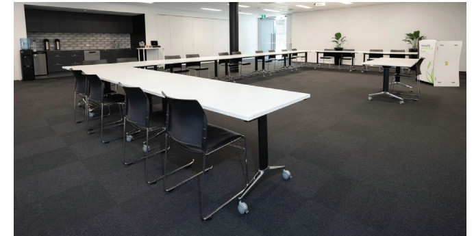
U-Shape: 24 person capacity