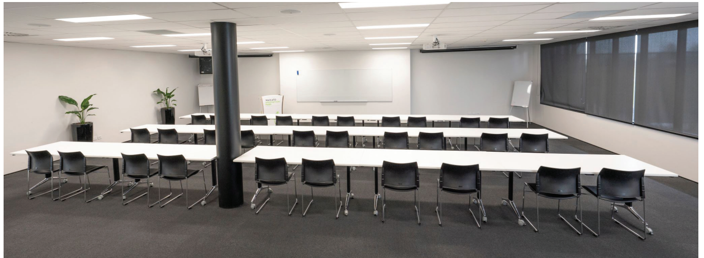
Classroom: 30 person capacity