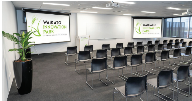
Theatre: 80 person capacity (maximum)

The room may be arranged to suit your requirements. Popular layout options are as follows: